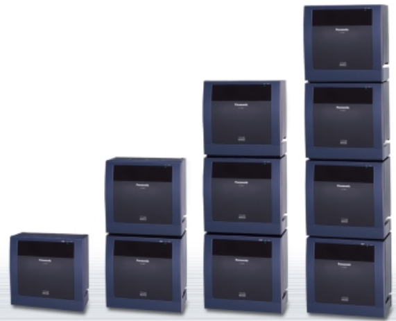
Line-up : KX-TDE600 and the optional Expansion Shelf KX-TDE620 (Max3)

*4 Only a single VPS can be connected to one optional service card.